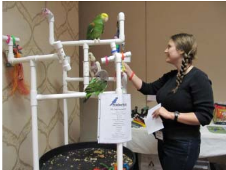
Some baby birds from Featherhead interact with a speaker at the Bird Mart