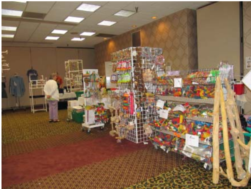
View of Bird Mart