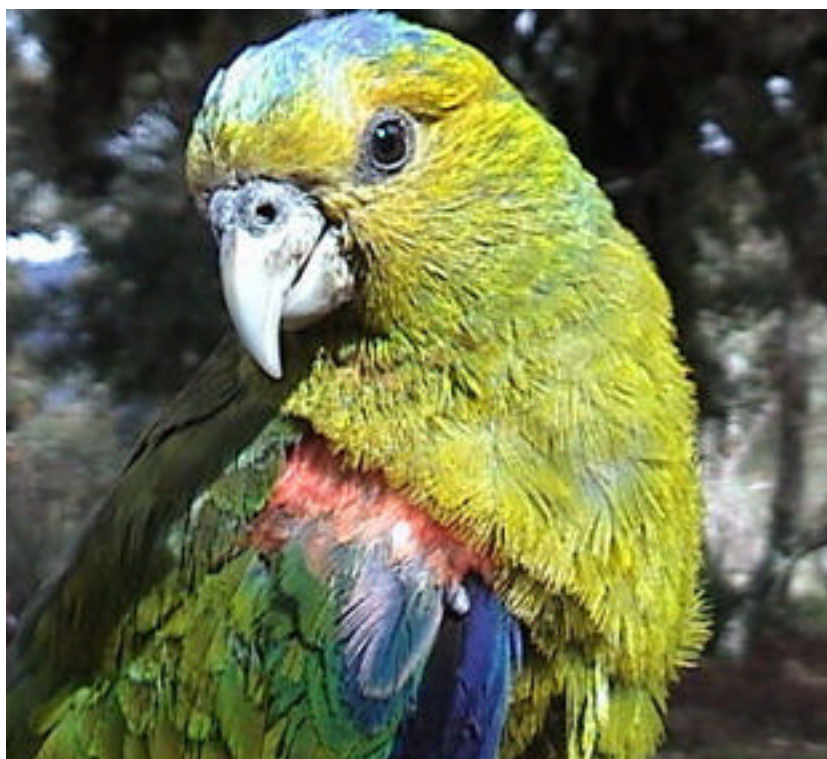
Above Indigo-winged parrot

* Note date change ** Different Location