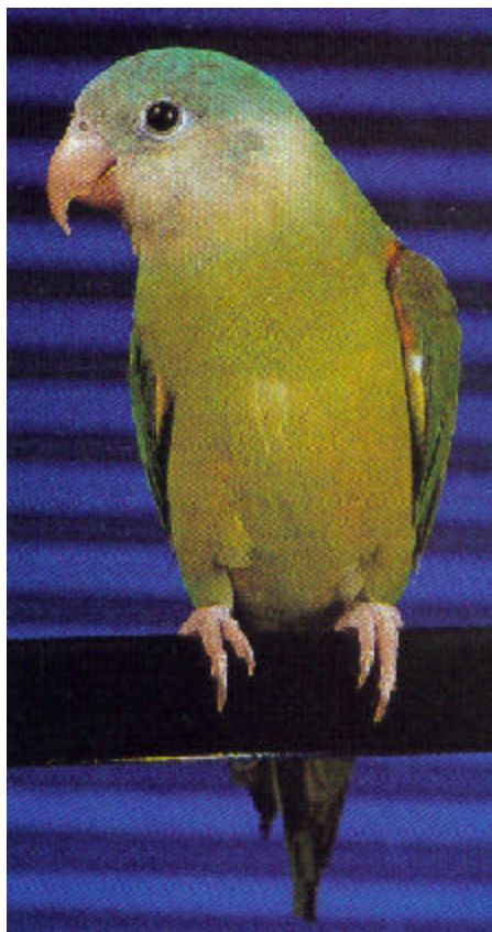
Above Grey-cheeked Parakeet

They have shown their adaptability not just in their accommodation of metropolitan areas but also in their nesting habits. They not only nest in available cavities, as do most other